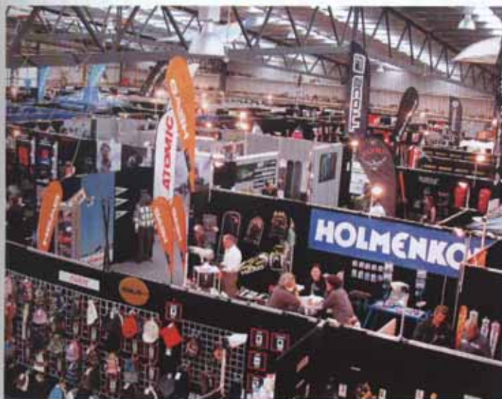
The New Zealand Snow Sports Industries Federation Trade Fair in full swing at Lake Wanaka

Wanaka may be a 'fledgling' destination when it comes to conferences, incentives and exhibitions. However, the region does have a reputation for hosting corporate retreats and the wider sector took a boost with the recent hosting of the New Zealand Snow Sports Industries Federation (NZSIF) Trade Fair. It is also looking forward to being the host region for the i-SITE Conference in September.